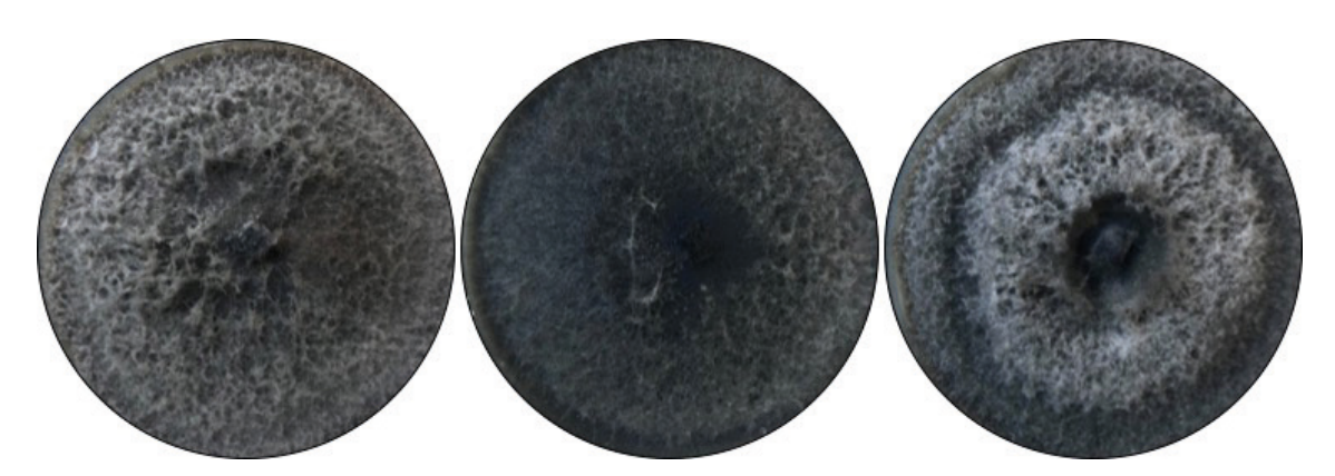
Fig. 2. Three examples of Sphaeropsis sapinea morphology on 1.5% MEA plate. The hyphae color can vary from light grey to intense black.