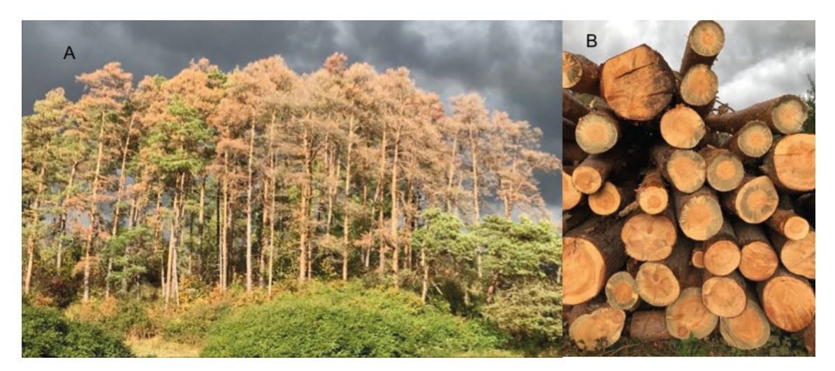
Fig. 4. Example of mature Scots pine stand that died during growth season of 2019, due disease caused by Sphaeropsis sapinea . Scots pine trees were stressed due to high temperatures and drought during 2010 and 2018 that lead to Diplodia tip blight disease epidemic, Germany 2019 (A). Blue stain developes fast in dead trees that can be seen after felling, partly this blue stain is due to S. sapinea , Germany 2019 (B).

to be between 2.5 °C and 5 °C by the year 2100 (Mikkonen et al. 2015). Drought is an important abiotic disturbance factor, as the susceptibility of pine trees to S. sapinea is strongly enhanced by water stress (Stanosz et al. 2001; Boland et al. 2004; Deprez-Loustau et al. 2006; Blaschke and Cech 2007; Sturrock et al. 2011; Bußkamp 2018). The average annual precipitation sums were observed to vary from 450 mm in Northern Lapland to 750 mm in Southern and Eastern Finland for 1981–2010 (Pirinen et al. 2012). Veijalainen et al. (2019) analyzed that drought risk due to climate change can increase in Southern and Central Finland. Especially the drought risk during summer and early autumn can escalate due to an increase in temperature and longer summer periods (Veijalainen et al. 2019). Additional stress in Scots pines due to higher temperatures and drought in most vulnerable areas in Finland could lead to epidemics caused by S. sapinea. Brodde et al. (2019) showed that the epidemics observed in Sweden started to culminate already 10 years beforehand (S. sapinea emerging as an endophyte). Similarly, Blumenstein et al. (2020) showed that S. sapinea is the most common endophyte in healthy and diseased Scots pine and the diseased trees can die fast in one dry summer season (Blumenstein et al. 2020). This scenario can happen in near future in Finland, and it could be possible that changes in local environment causing stress to Scots pines can trigger these epidemics.