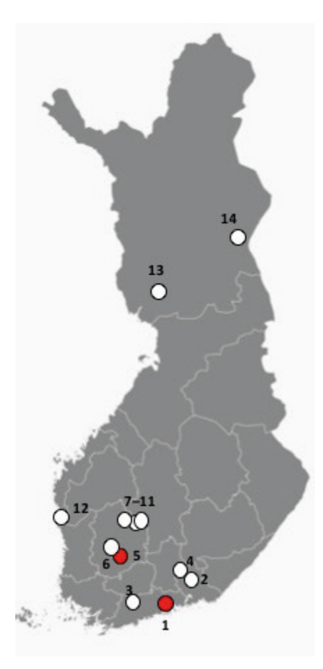
Fig. 3. Locations of the investigated Scots pine sites in this study as dots. Reprinted and modified from Free Vector Maps. Red dots indicate sites where Sphaeropsis sapinea was found in this study; number one (Vantaa) and five (Akaa).

Sphaeropsis sapinea was isolated from sixteen annual shoots harvested from four healthy symptomless Scots pine trees located in two different sites (Fig. 3, Table 2). They were considered as endophytic isolates as the hosts were healthy and the bark was intact. This means that the mycelium of the endophyte was already well established inside the host (under the bark) and it originated from surface sterilized plant tissue.