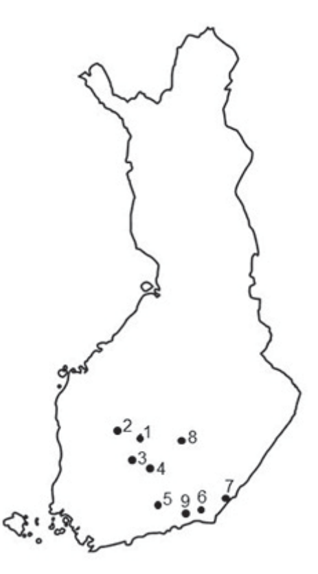
Fig. 1. Locations of the Norway spruce seed orchards in southern Finland. 1 = Heinämäki (no. 170; 62°13'N, 25°24'E), 2 = Metsä-Ihala (no. 176; 62°12'N, 24°07'E), 3 = Riihimäki (no. 169; 61°53'N, 24°52'E), 4 = Paronen (no. 365; 61°39'N, 26°17'E), 5 = Sillanpää (no. 235; 60°55'N, 26°13'E), 6 = Taavetti (no. 428; 60°56'N, 27°35'E), 7 = Imatra (no. 374; 61°09'N, 28°47'E), 8 = Suhola (no. 403; 62°15'N, 27°42'E) and 9 = Palvaanjärvi (no. 172; 60°48'N, 27°29'E).