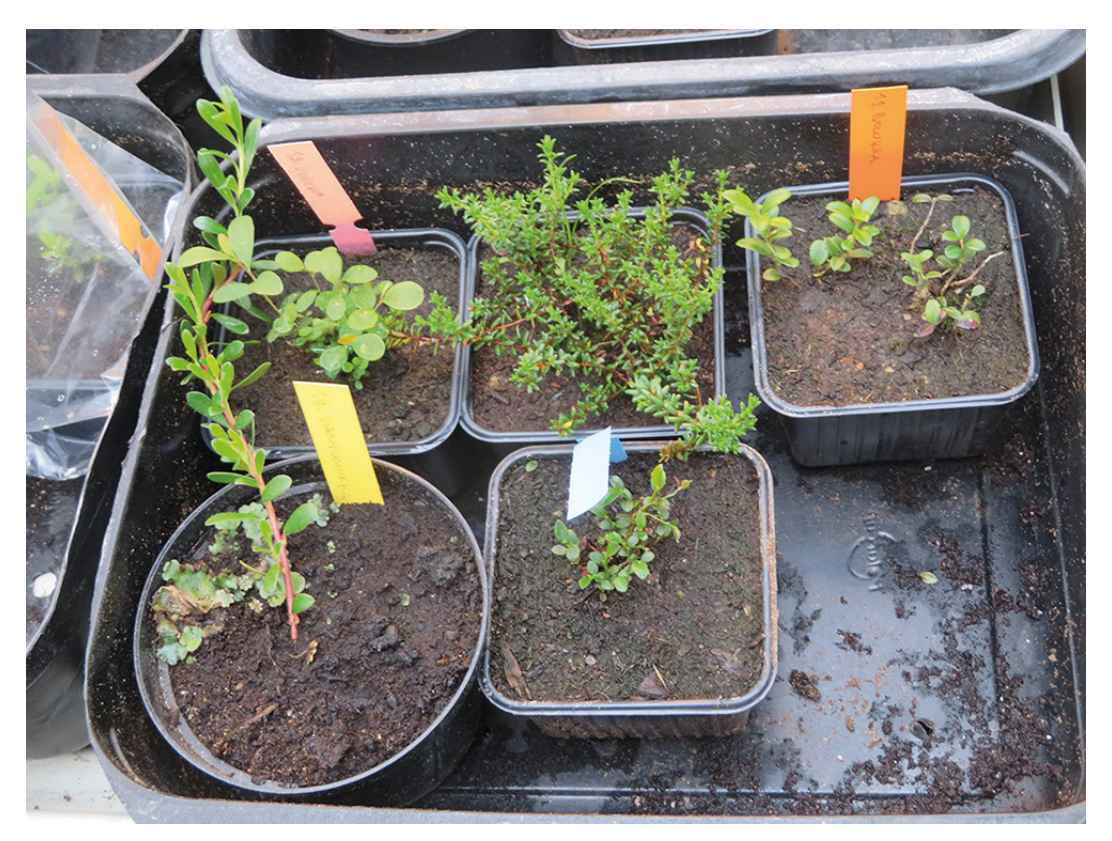
Fig. 2. Test plants inoculated in the greenhouse.

The leaves of the inoculated plants were checked for the formation of T. areolata uredinia after 2-, 4-, 6- and 8-weeks of incubation. The plants were left to overwinter outside the greenhouse and leaves of these plants were harvested in the spring 2019 and checked for T. areolata uredinia and telia.