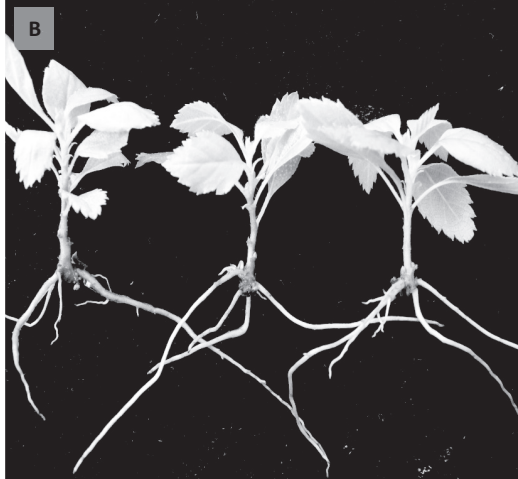
Fig. 1. Adventitious root formation in Alnus glutinosa microcuttings rooted in medium containing IBA 0.1 mg l<sup>-1</sup> for 7 days (A) or without IBA (Control, B). Development of lateral roots was lowest in the control treatment.

control and 90% in the IBA treatment, respectively. The mean number of roots that developed in each shoot increased from 1.9 to 3.0 in the presence of IBA, which also favoured root elongation. The mean length of the roots was 26.4 mm in the control specimens, and 35.7 mm in the shoots treated with auxin. In both treatments, the roots were reddish in colour and no callus was observed at the base of the shoots. In the shoot treated with auxin 63% of the roots developed lateral roots, whereas in the control only 43% of