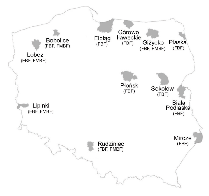
Fig. 1. Geographical layout of the forest districts where the test plots were located (Lachowicz 2015).

On the test plots, the diameters at breast height (DBH) of all trees were measured; those with diameters of less than 7 cm were excluded. The sample trees on the test plots were chosen using Hartig's method based on the mean DBH, using three thickness classes: class 1 – the thinnest trees, class 2 – average thickness trees, and class 3 – the thickest trees (Grochowski 1973). From each thickness class, two trees with DBH close to the mean DBH for the class were chosen and felled, making six trees from each sample plot. In total, sample materials were collected from 306 trees. Two or three 50-centimetre-long trunk sections were cut out (below the 1.3-metre height point